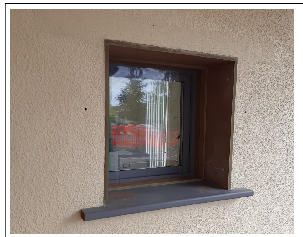
This is the Secretary's hatch. All visitors/parents must wait here. It is always best to ring or email in advance.

We operate staggered opening and closing to reduce footfall on the school grounds. We also operate three separate break times. Signs are raised in the morning when it is time for the pupils to come in. Please don't send your child in too early. If it starts raining heavily we will start moving the children in from 9.