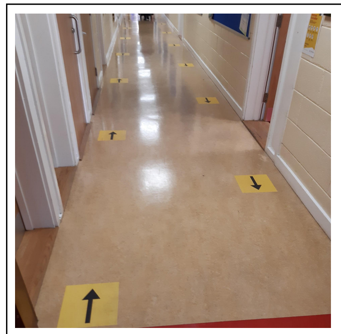
We have a one way system of movement throughout the building.