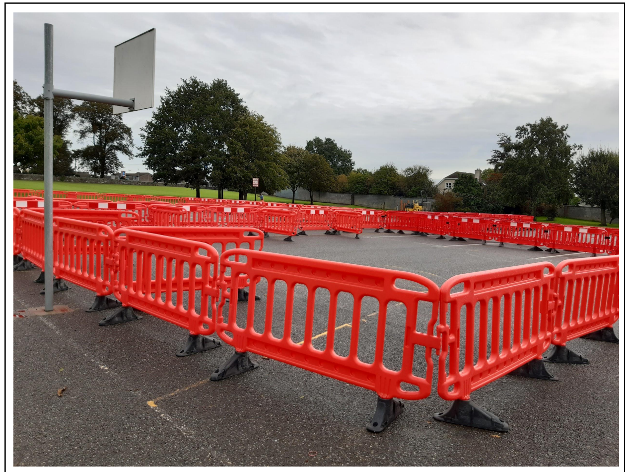
We have erected barriers so when classes play outside they remain separated from other classes. This ensures that they remain in their class "bubble"